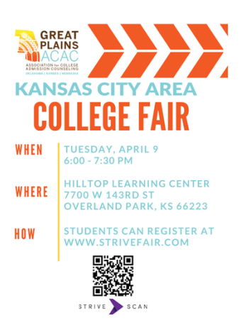
KC Area College Fair